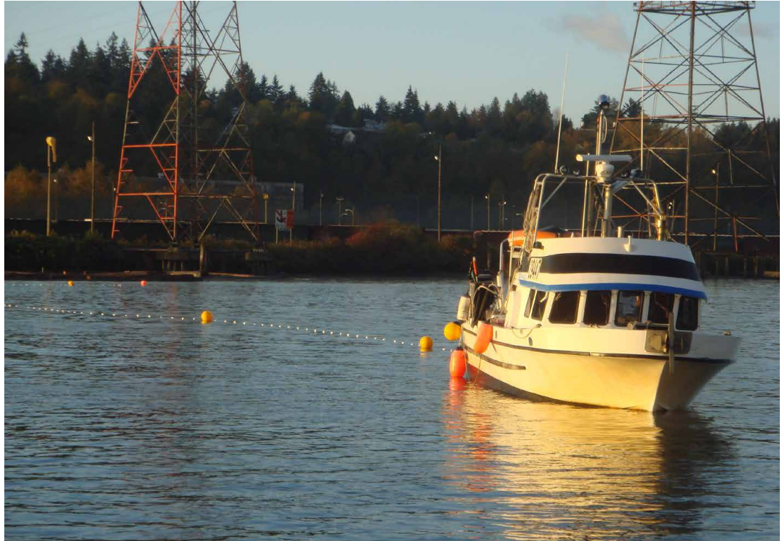
WATERSHED WATCH SALMON SOCIETY

We recommend additional purposes or preambles to assist with interpretation of the Fisheries Act . For example, the US Magnuson Stevens Fishery Conservation and Management Act has seven purposes, including to take immediate action to conserve and manage the fishery resources found off the coasts of the United States, and to promote the protection of essential fish habitat in the review of projects conducted under federal authority. 19 Other federal environmental laws contain useful precedents of purposes or preamble clauses, such as the Oceans Act , Migratory Birds Act and Canadian Environmental Assessment Act, 2012 .