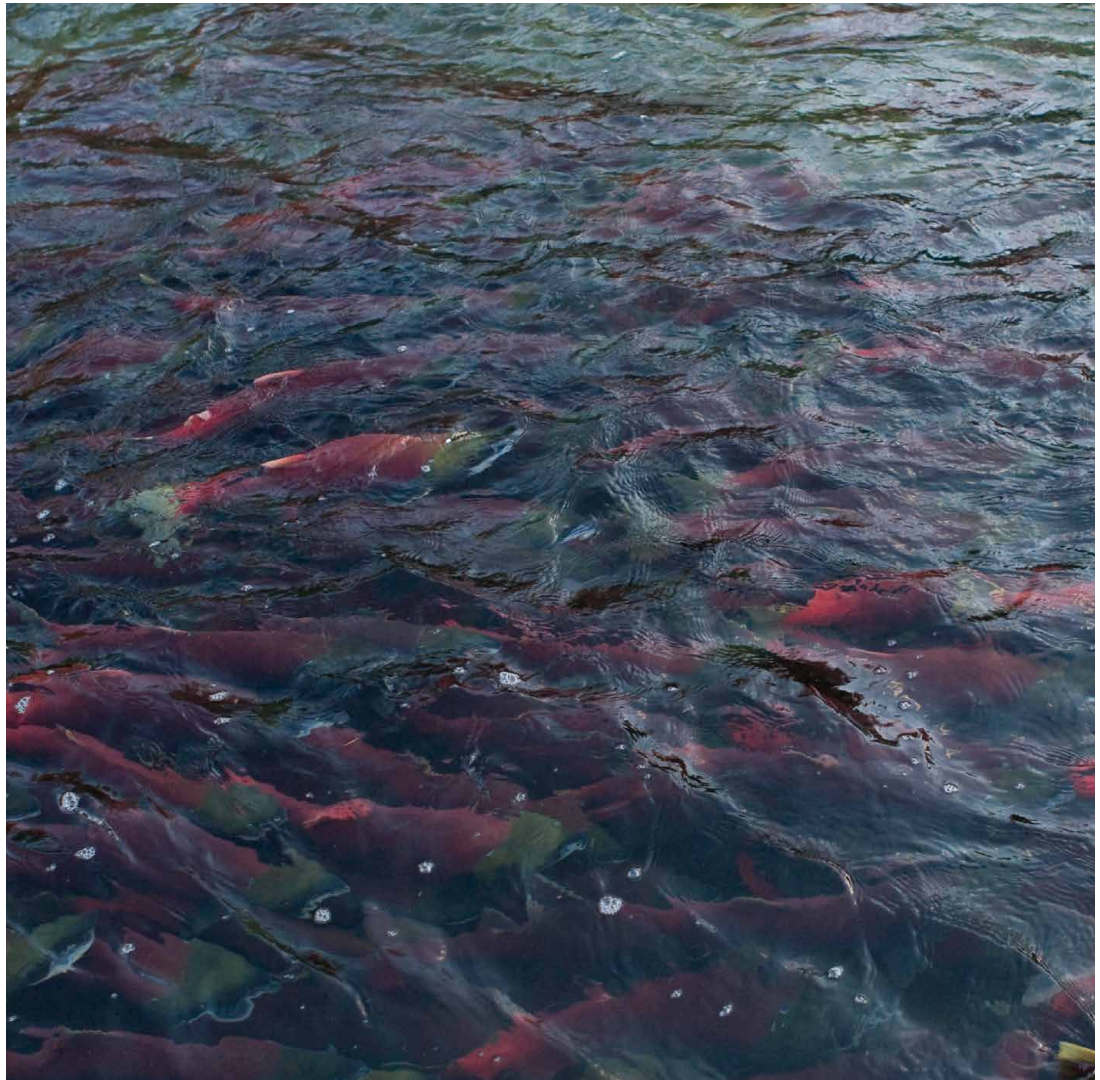
WATERSHED WATCH SALMON SOCIETY

The policy goal in the 1986 Policy for the Management of Fish Habitat (1986 Policy) was to ensure a net gain of habitat for Canadian fisheries resources, a goal that was widely lauded though difficult to achieve in practice. The Fisheries Protection Policy Statement, 2013, which replaced the 1986 Policy when the Fisheries Act was amended, omits this goal. The concept of no net loss should be restored through policy or amendment to the statute or regulations.