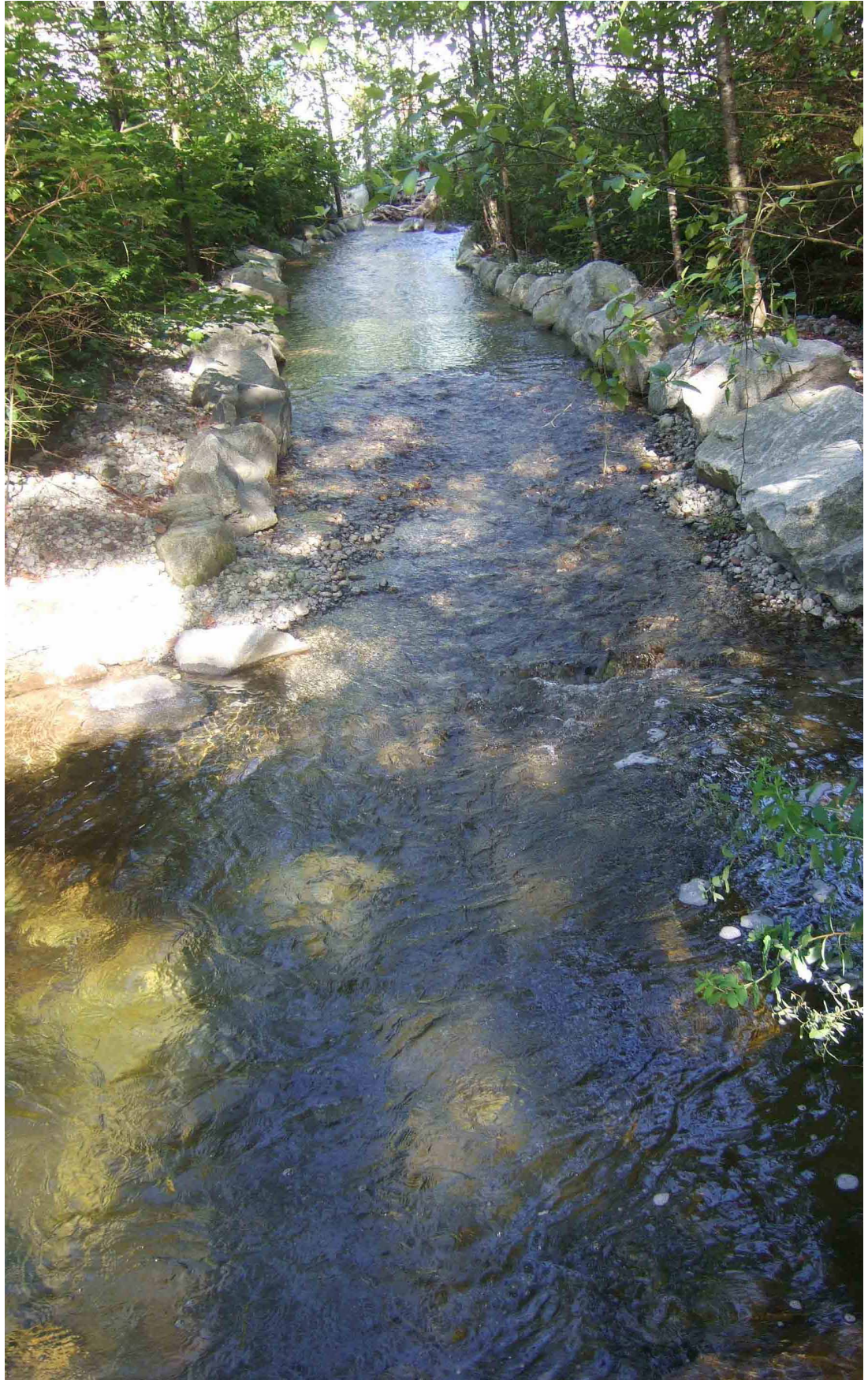
WATERSHED WATCH SALMON SOCIETY